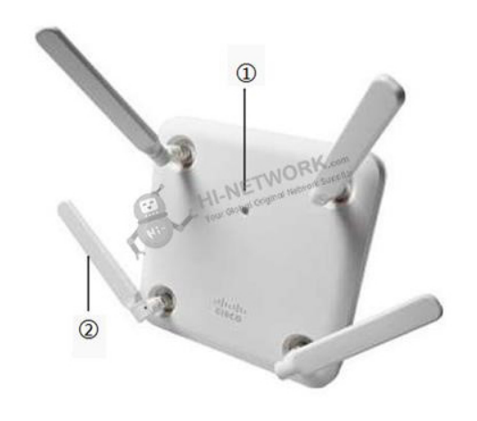
Figure 2 shows the AIR-AP1852E LED Indicator Position.