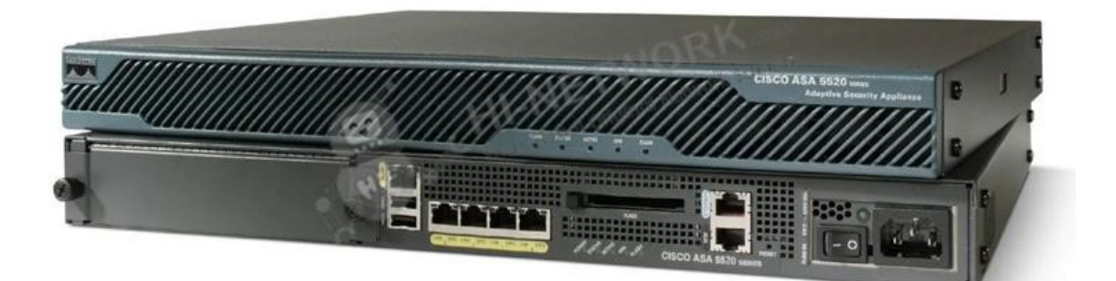
Figure 1 shows the appearance of ASA5520-K8.