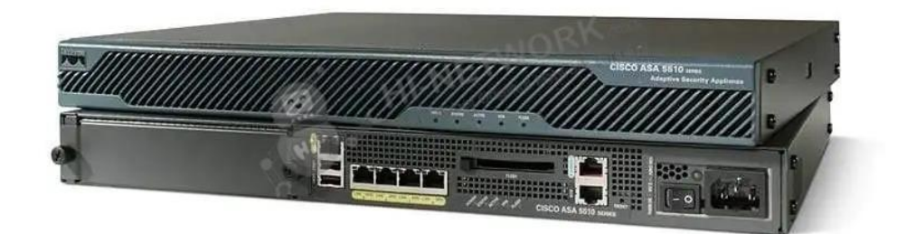
Figure 1 shows the appearance of ASA5510-SEC-BUN-K9.