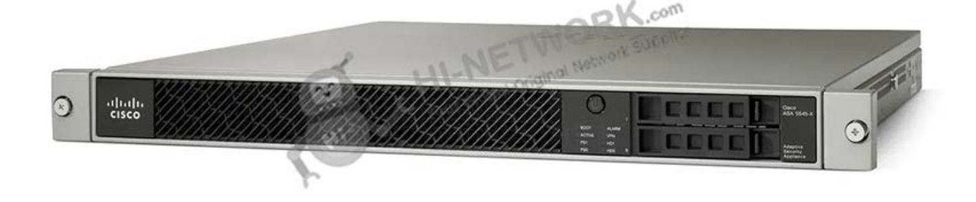
Figure 1 shows the front panel of ASA5545-K9 for reference. ASA5545-K8 has the similar ports.