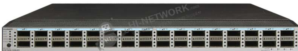
Figure 1 shows the appearance of CE7850-32Q-EL.