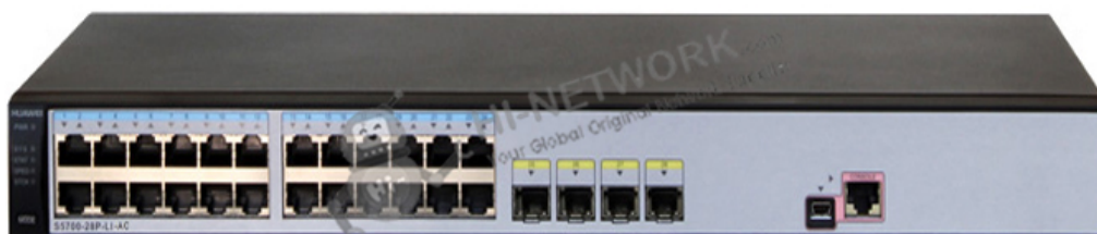
Figure 1 shows the appearance of S5700-28P-LI-AC.