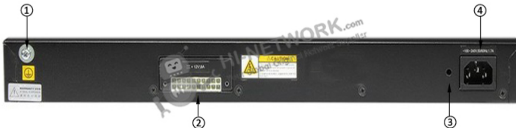
Figure 3 shows the back panel of S5700-28P-LI-AC.