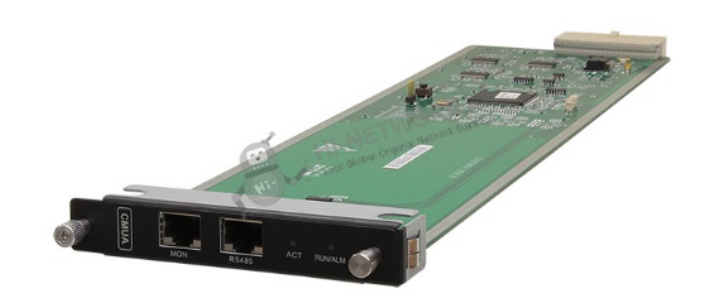
Figure 1 shows the appearance of EH1D200CMU00.