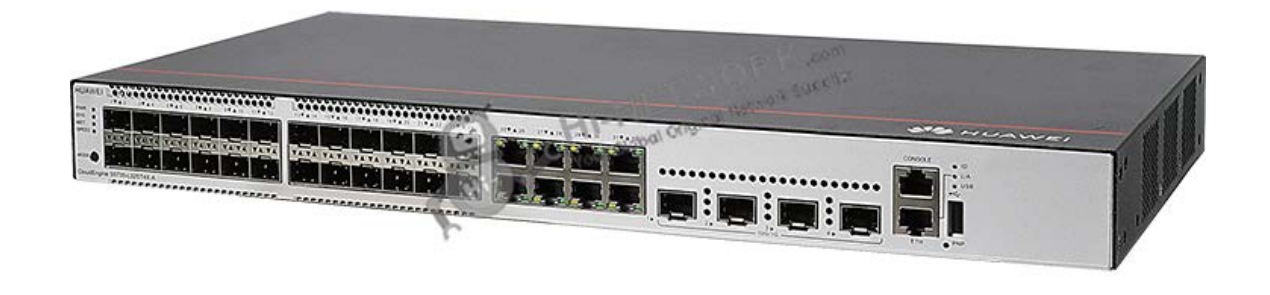
Figure 1 shows the appearance of S5735-L32ST4X-A.