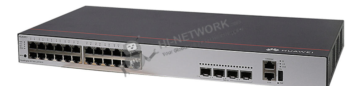
Figure 1 shows the appearance of S5735S-L24T4X-A.