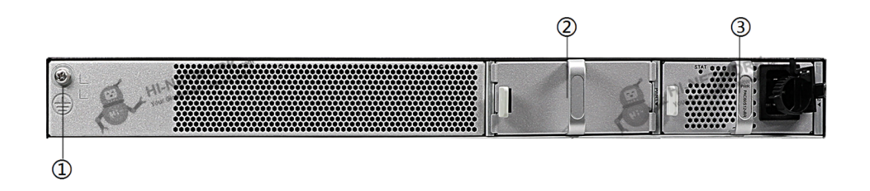
Figure 3 shows the back view of S5735-S24T4X-I.