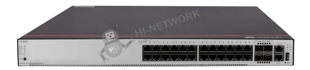
Figure 1 shows the appearance of S5735-S24T4X-I.