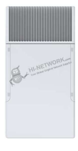
Figure 1 shows the appearance of S5735-S8P2X-IA200H1.